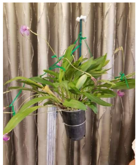
How I like to travel!!