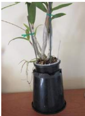
How I like to be shown!!