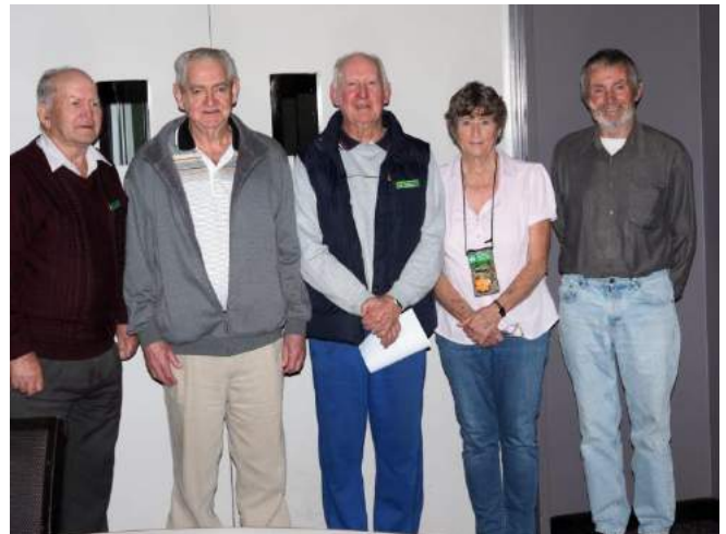
Five Life members attending our last meeting in June

Are scheduled for 1pm and will be in room nearest the Bistro ( not our old room ) Benching @ 1pm for 1.30 pm meeting Between 1pm - 1.15pm will be workshop corner.