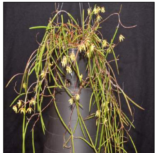
Dock. Stephen x fulginosa