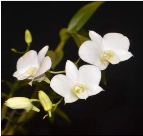
Den. bigibbum var alba