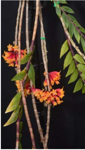
Den. lawesii var. bicolor 'Georgie'