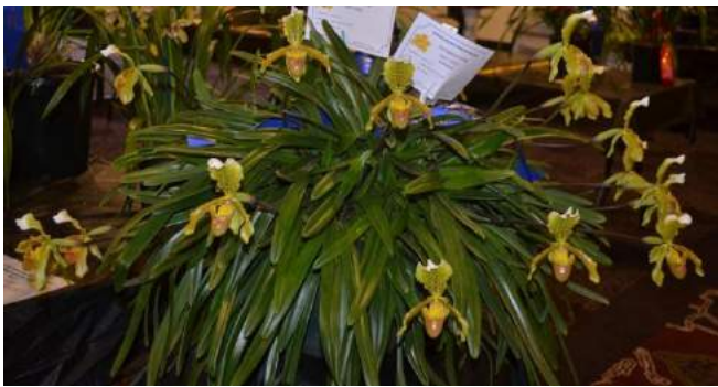
Paph. insigne Sandra Ellis