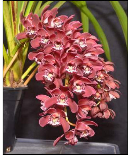
Cym. Jean Siskel 'Lucy'